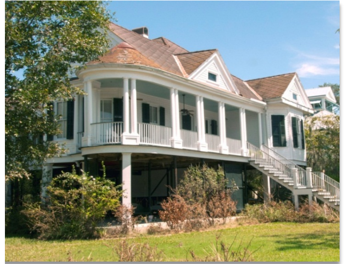
Figure 1: House elevated above the BFE with 1 foot of freeboard

Communities that incorporate freeboard into their local floodplain ordinances can earn discounts on flood insurance by participating in the NFIP’s Community Rating System (CRS) program. CRS rewards communities that engage in floodplain management activities that exceed NFIP standards by offering discounts of up to 45 percent on flood insurance policies written for SFHAs in NFIP-participating communities.