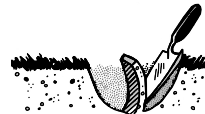
Figure 3. Soil sampling with a trowel.

Use clean sampling tools and containers to avoid contaminating the soil sample. Never use tools or containers that have been used for fertilizer or lime. Collect samples with tools like trowels, shovels, spades, hand probes or hand augers.